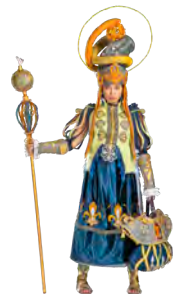
Whispers garment Poiesis