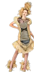
Grace Nucifora Vintage Paper