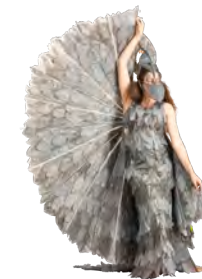
Ardea Murphy Regeneration