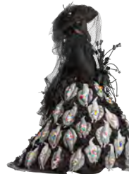
Meagan Howe Mourning Birds